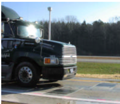
Truck Crossing WIM Scale