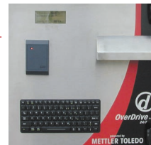
UADT Terminal with JagXtreme Instrument at Scale

Ethernet CAT 5 cable connection (up to 300 feet distance) Optionally fiber optic or wireless connection