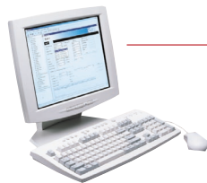
PC in Building

The UADT terminal is located at the scale, prompts the driver for information, and communicates bi-directionally with an office PC running OverDrive via an ethernet connection. A wireless connection can also be used. A UAPC terminal with a touchscreen Industrial grade PC running OverDrive at the unattended terminal is also available.